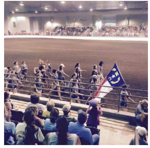
Above: NC 4-Hers participate in the Parade of States at the 2015 Southern Regional 4-H Horse Championships in Perry, Georgia.

Can my horse eat that? Potato - no (choking hazard); Chocolate - no (is toxic, similar to dogs); Watermelon yes; Broccoli - no (can cause severe gas in large quantities); Coca Cola - yes; Muffins - yes. The main thing to remember when feeding treats is MODERATION!