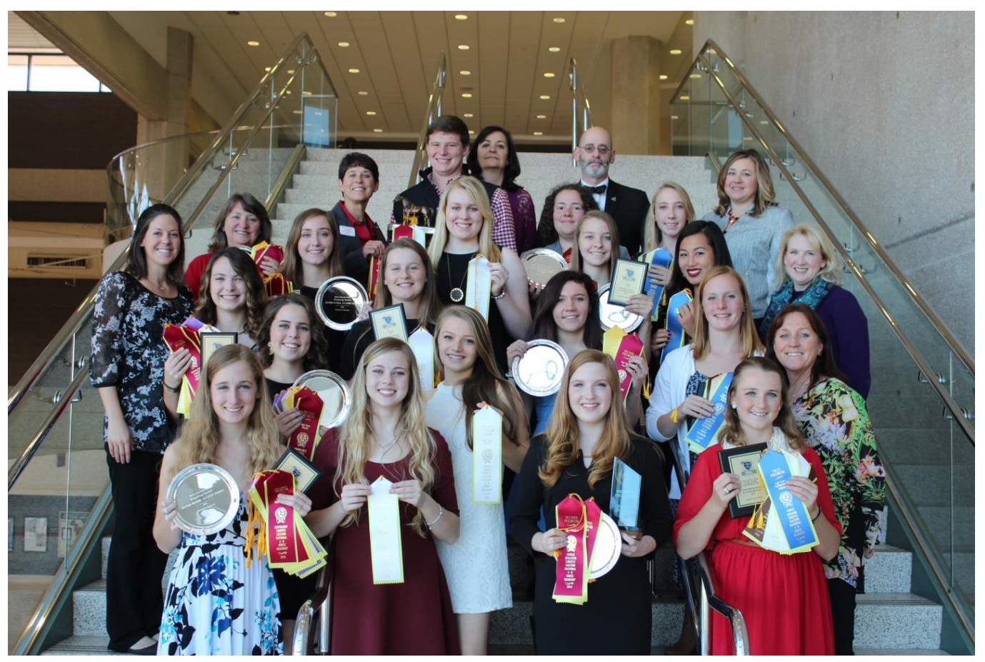
Above: The 2016 North Carolina Delegation at the Eastern National 4-H Horse Roundup in Louisville, KY