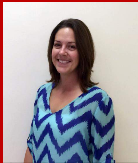
Each month we profile a former NC 4-H Horse Program member to catch up with them and highlight some of the amazing things our graduates go on to achieve!